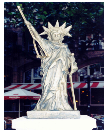
Let's mobilise for our rights!

Be all there to call for a discrimination free Europe for citizens with disabilities!